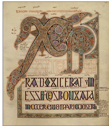
A page from the Anglo-Irish Lindisfarne Gospels, from the same era as Bede.

In 597, about a century and a half after the pagan Angles and Saxons had arrived from the Continent to over-run the Christian Celts in Britain, pope Gregory the Great sent the missionary Augustine to reclaim the island for the faith. Though the outcome was by no means